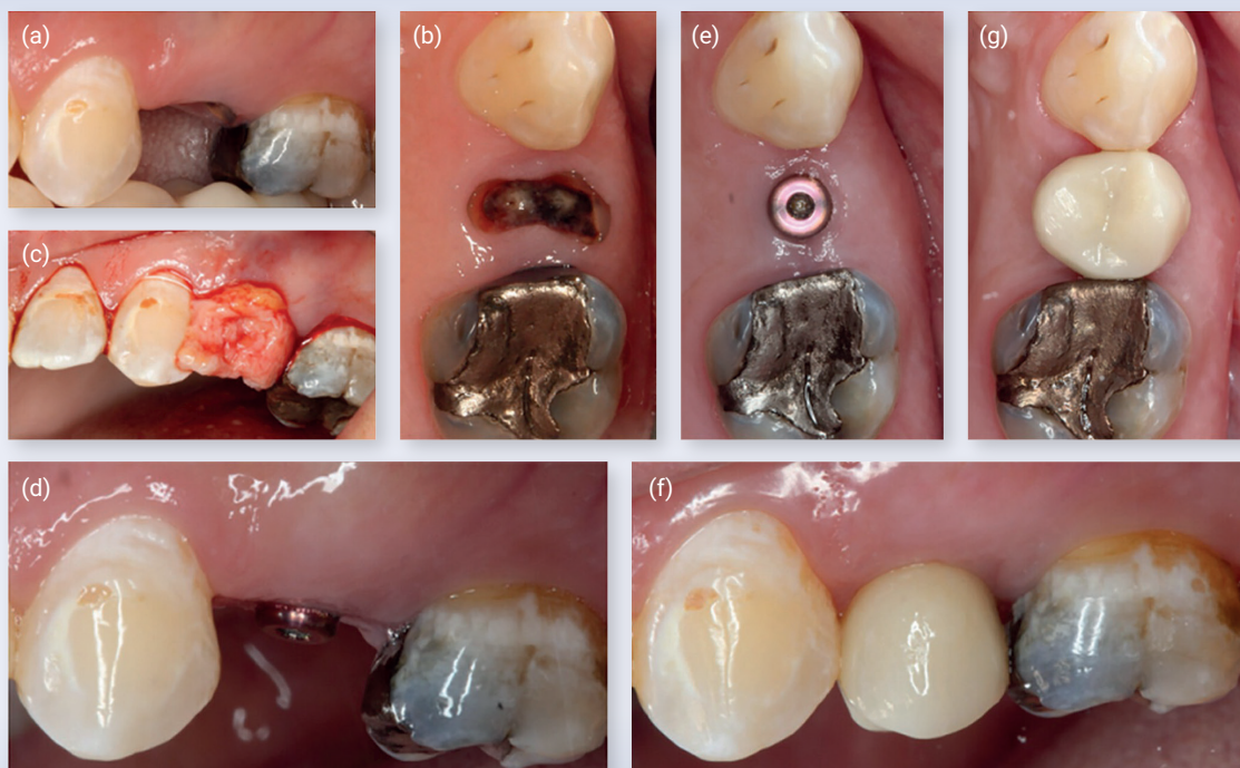
Figure: Immediate implant with subepithelial connective-tissue graft group (SCTG group)

Note: (a) pre-surgical clinical photograph, buccal view; (b) pre-surgical clinical photograph, occlusal view; (c) placement of a subepithelial connective-tissue graft; (d) six-month clinical photograph, buccal view; (e) six-month clinical photograph, occlusal view; (f) 12-month clinical photograph, buccal view; (g) 12-month clinical photograph, occlusal view.